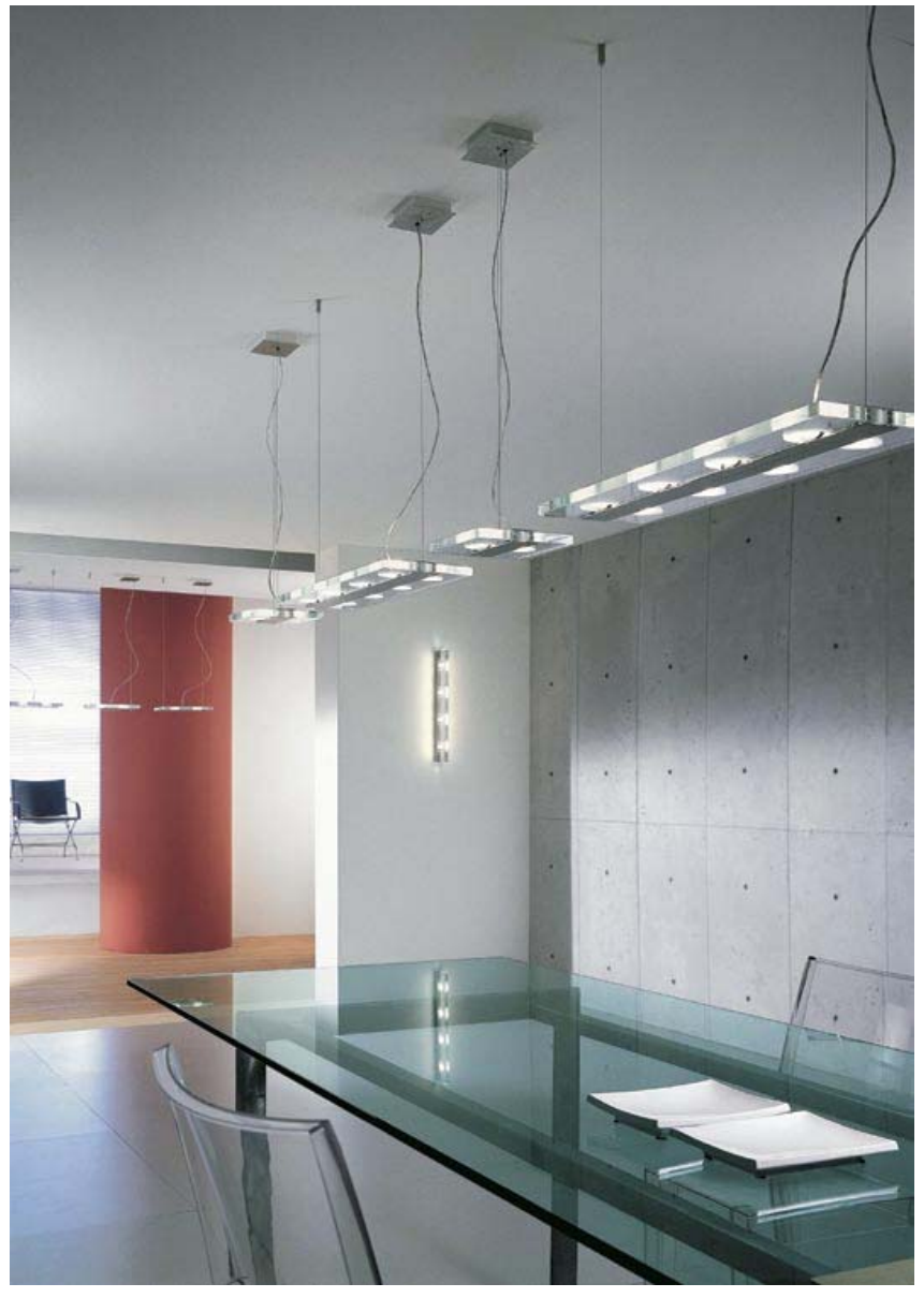
2x75Watt max G9 halogen 6 _"length x 8 5/8"wide 78 _" overall height

Beveled glass linear halogen semi flush mounts and suspension pendants Mounting | Ceiling mount only. Can be mounted on standard 4" octagonal junction box Materials | Glass diffusers, metal frames and body Finishes/Colors | Emerald green or extra clear glass, brushed steel body Notes | Height can be field adjusted. Glass hangs in horizontal position