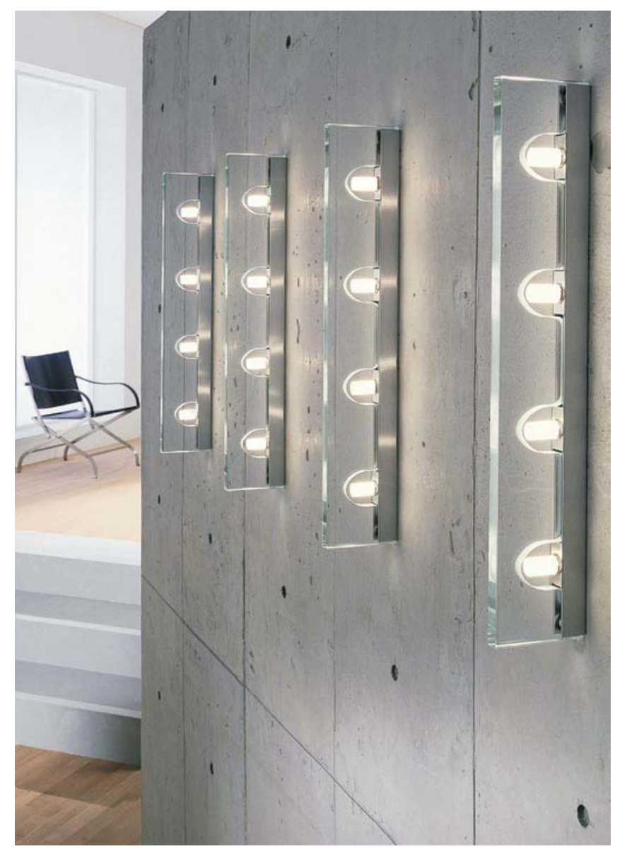
75Watt max G9 halogen 6 _"wide x 2 3/8"height, 4 «" projection